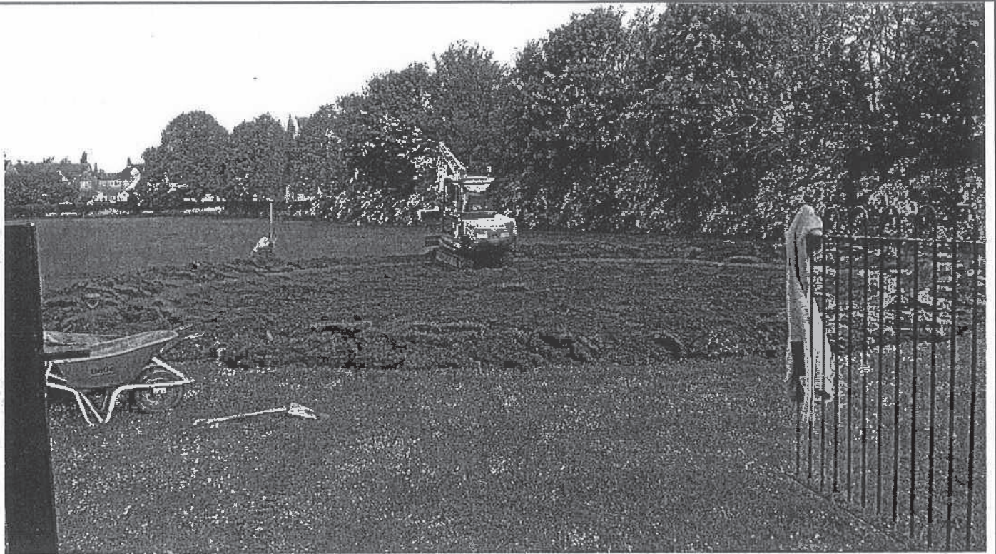
On schedule – Phase 1 – Tuesday 6 th May 2014